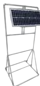
SolarPak Charger (optional)